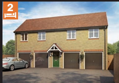
Towcester Two bedroom coach house