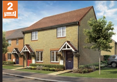
Hereford Two bedroom house

Please see separate information sheets for more details.