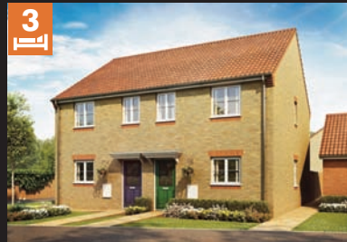
Ashton Three bedroom house